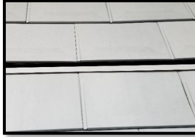
Pre-Patina II ZALMAG®